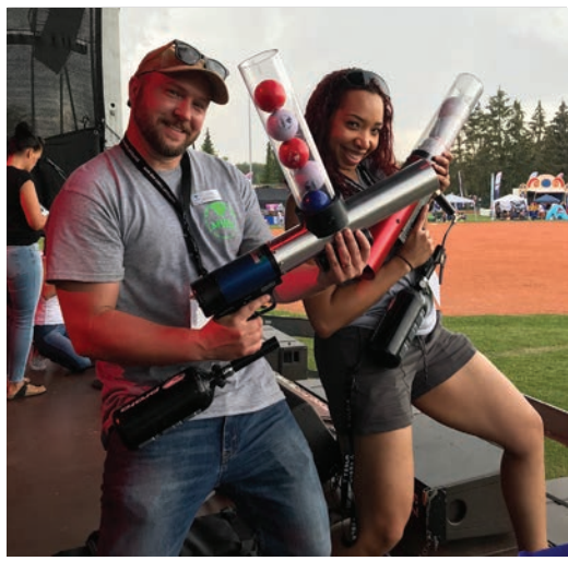
Dispensing swag, 4th of July Event, 2018

We also manage a robust Commercial Sponsorship Program that brings in hundreds of thousands of dollars! This support helps enhance our programs and services, such as 4th of July, the C.A.R.E Fair, the upcoming Frosty Fest, not to mention fun prize giveaways like free turkeys, travel vouchers for MWR Tours, Edelweiss stays, and a $25K Hole-in-One Golf Giveaway!