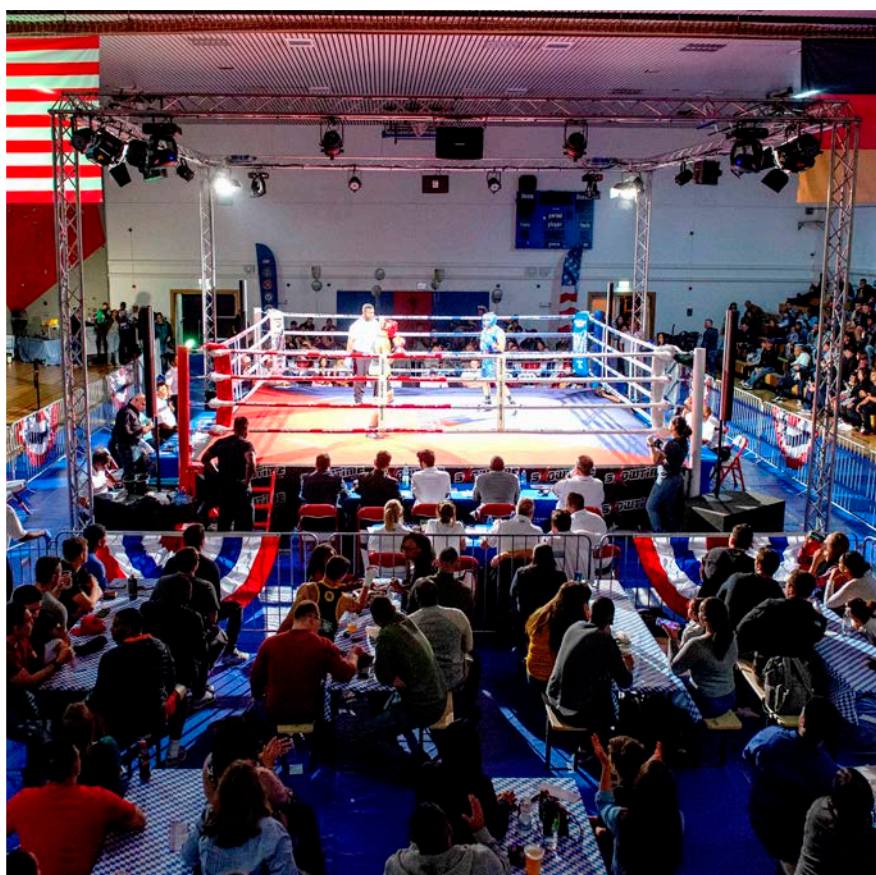
USAG Stuttgart Oktoberfest Boxing Championships, October 20, 2018.

In each issue we'll run a photo taken by a community member. Send your favorite shot to stuttgartmwr@gmail.com . Include your name and any info about the photo you'd like to share (title, location, camera, etc.). We can't promise you fame and fortune, but we just might publish your photo!