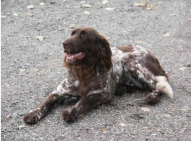
German Longhair (Deutsch Langhaar)