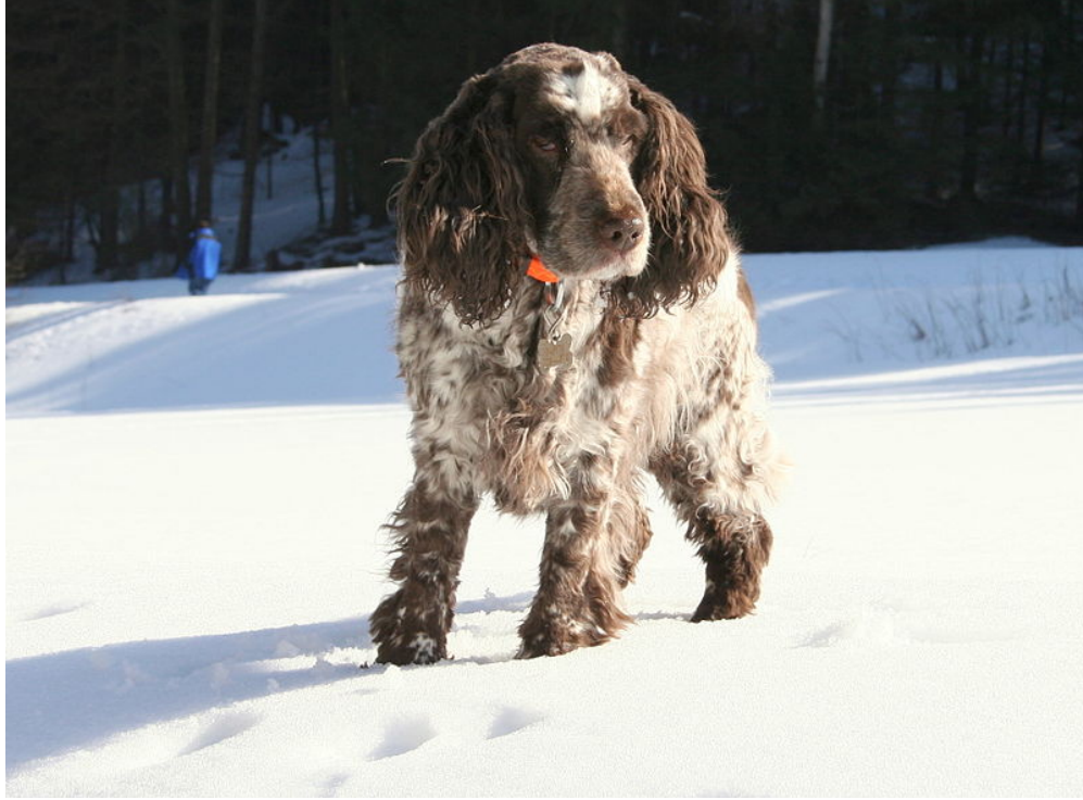
Cocker Spaniel (Cocker Spaniel)

U.S. Forces Europe Hunting, Fishing, and Sport Shooting Program