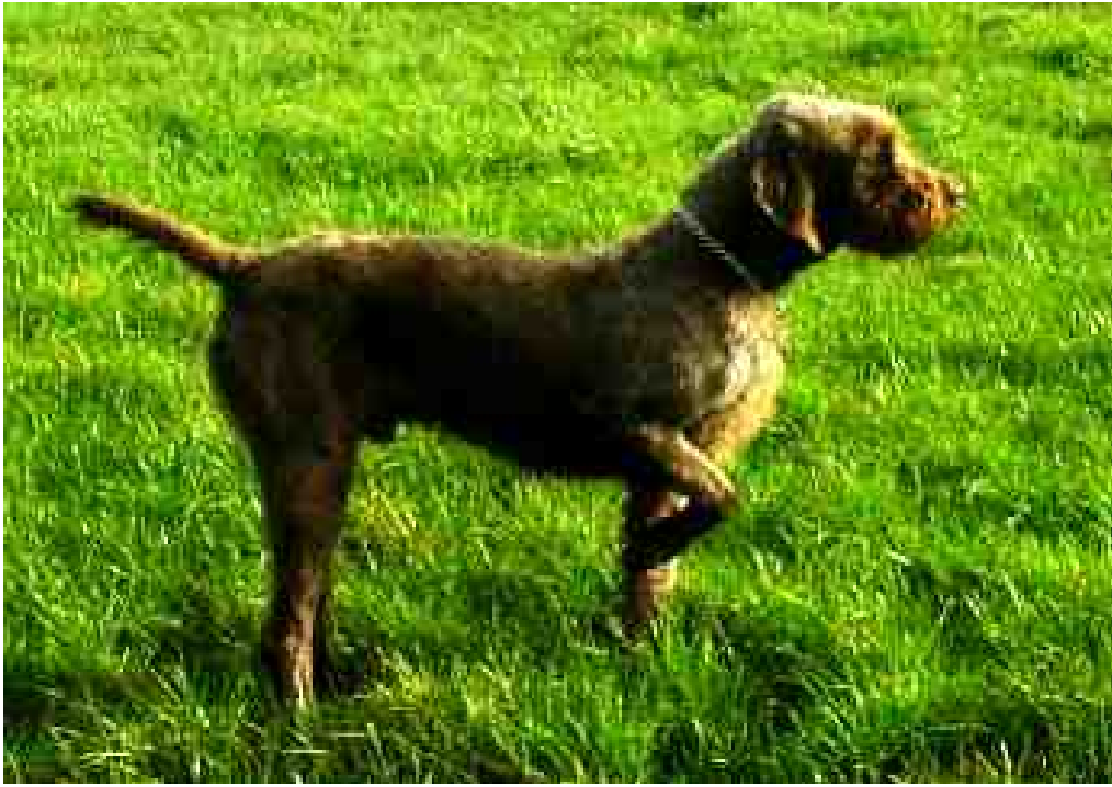
Poodle Pointer (Pudelpointer)