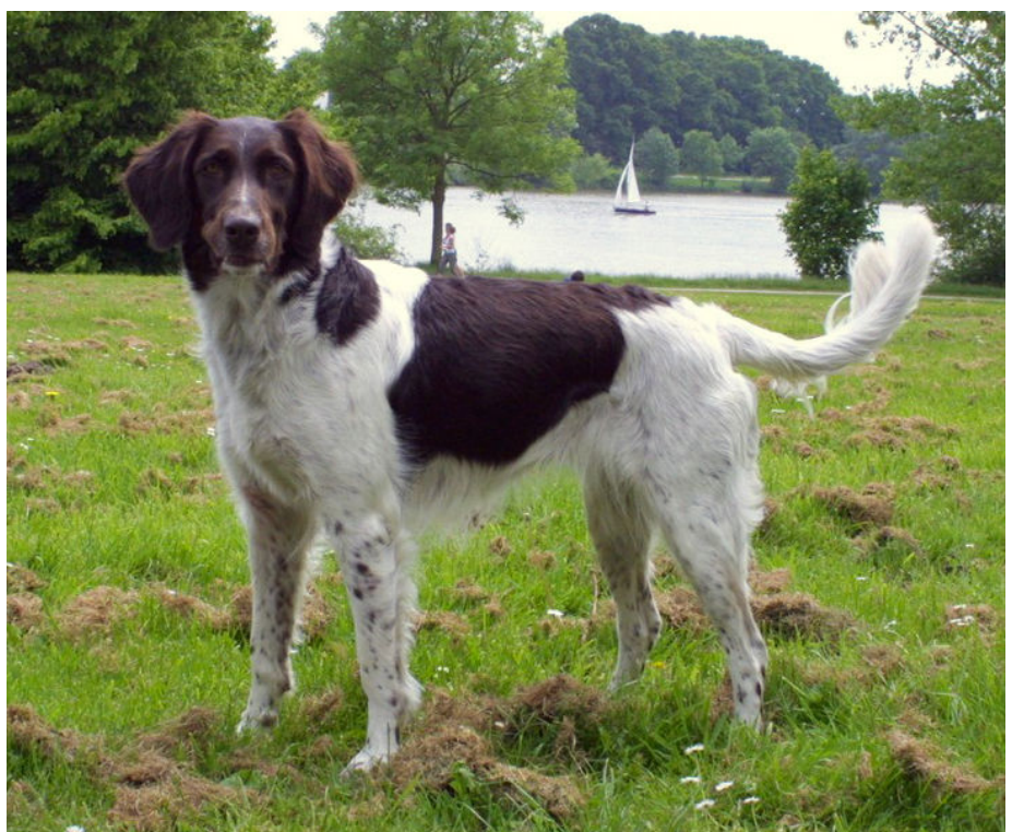
Small Münsterländer (Kleiner Münsterländer)