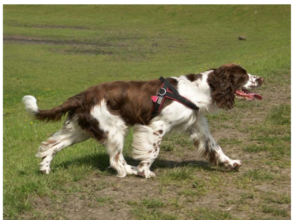
Springer Spaniel (Springer Spaniel)