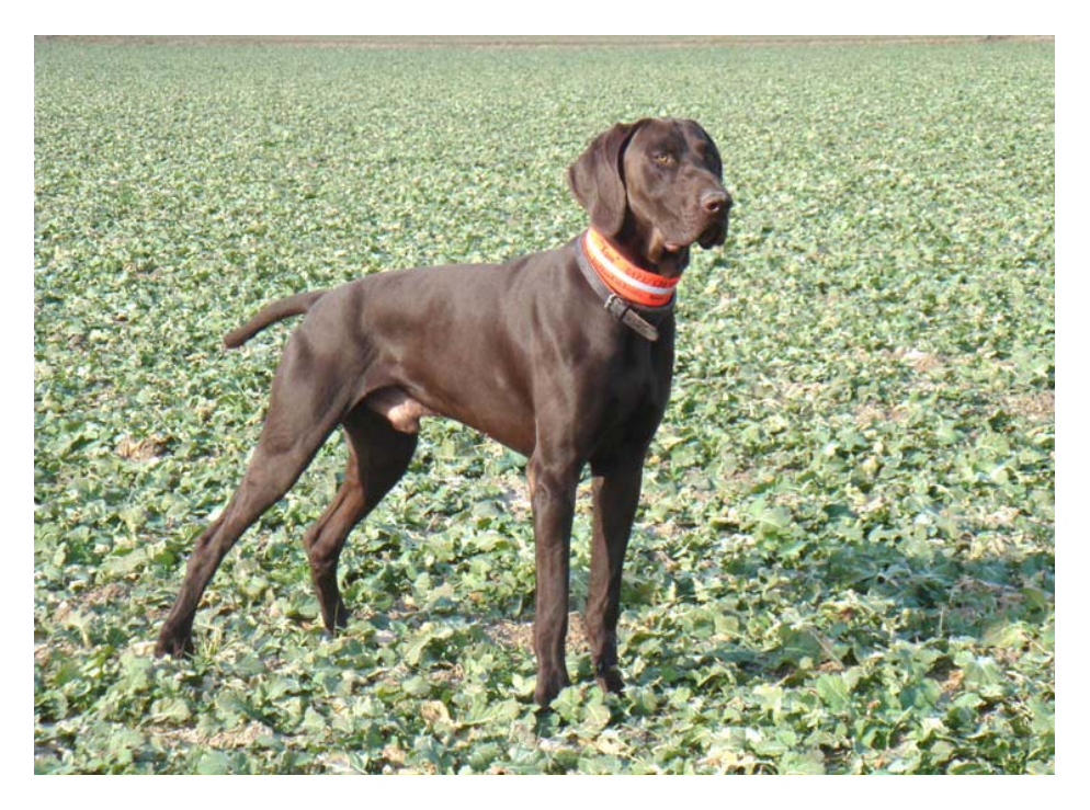
German Shorthaired Pointer (Deutsch Kurzhaar)