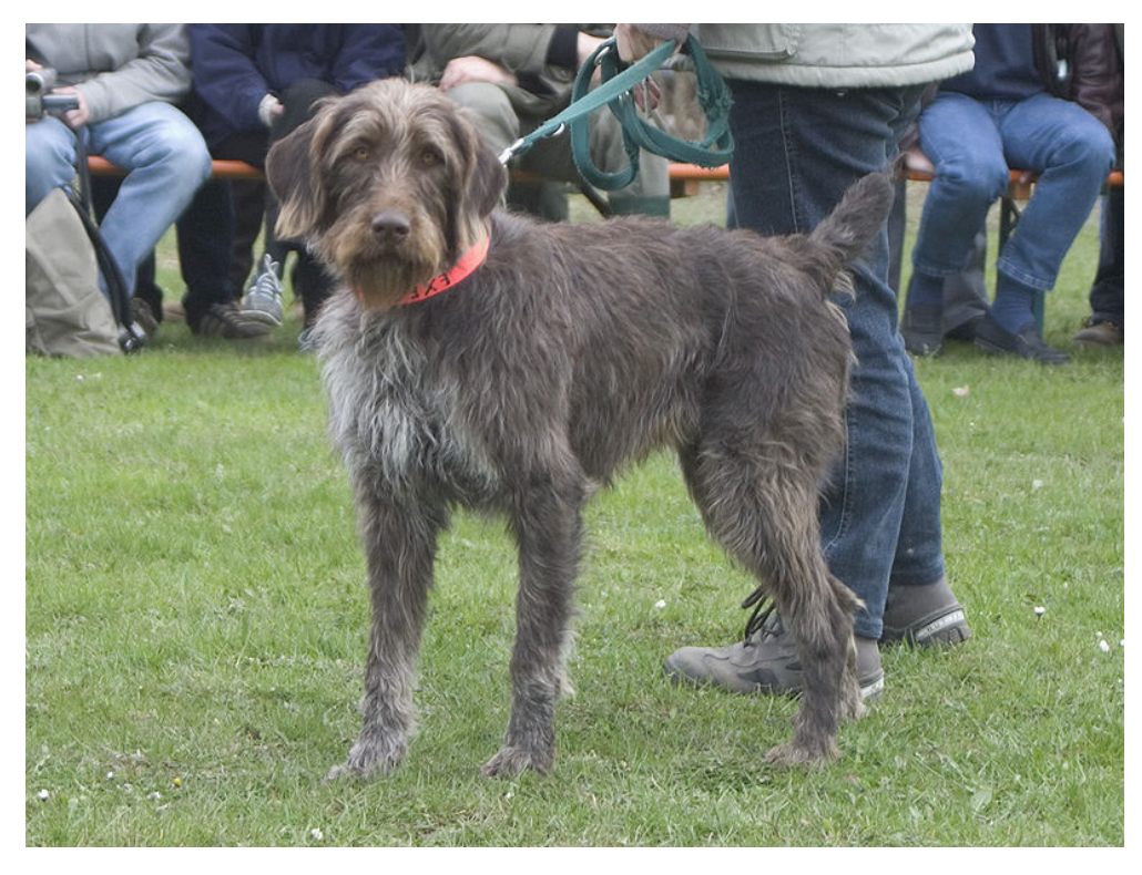
German Rough Hair (Deutsch Stichelhaar)

U.S. Forces Europe Hunting, Fishing, and Sport Shooting Program