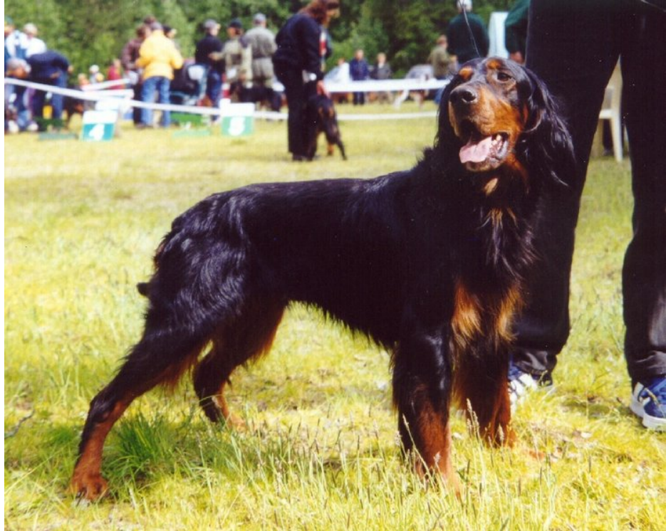
Gordon Setter (Gordon Setter)