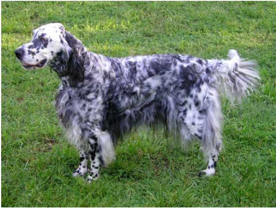
English Setter (English Setter)