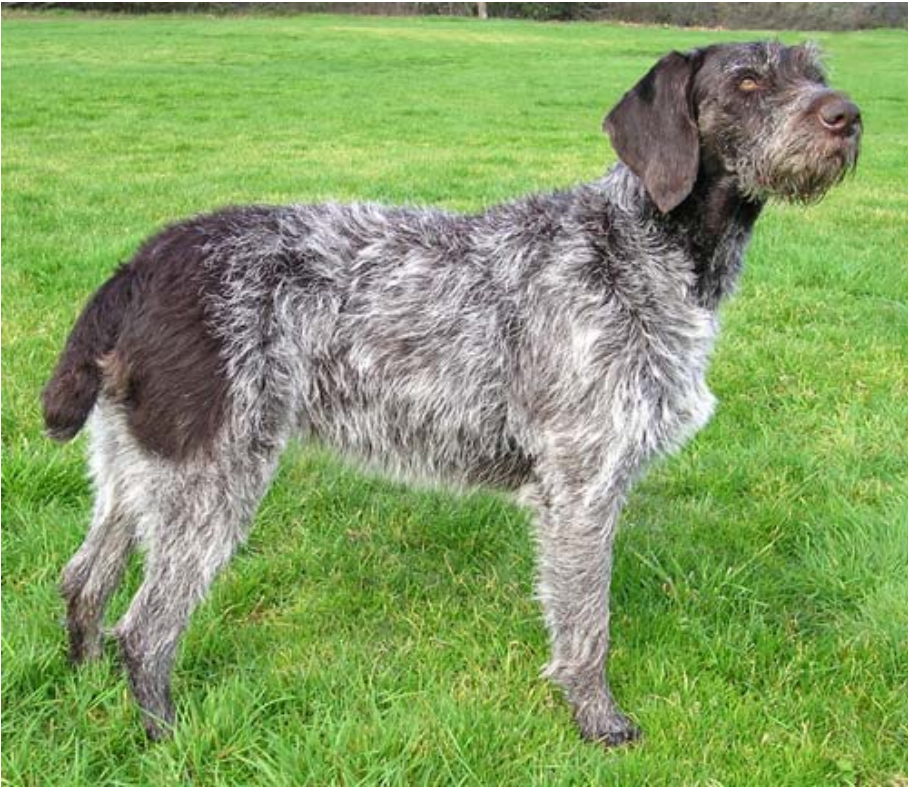
German Wirehair (Deutsch Drahthaar)