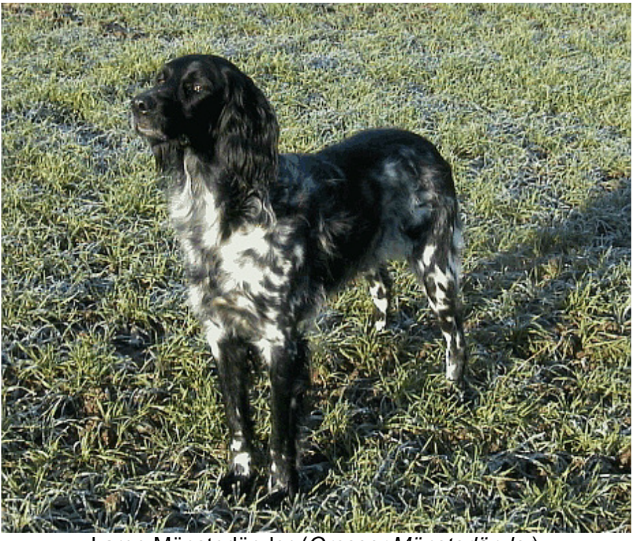
Large Münsterländer (Grosser Münsterländer)