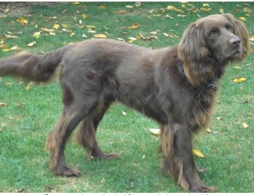
German Longhair (Deutsch Langhaar)

Pointers ( Vorstehhunde ) are the bird dog types and include the German Short-, Wireand Long-haired Pointers; Irish Setter; English Setter; and English Pointer. These dogs are used as pointers and retrievers in small game hunting and also for tracking wounded big game. They are clever, easily trained, very willing to trail game, point, and retrieve.