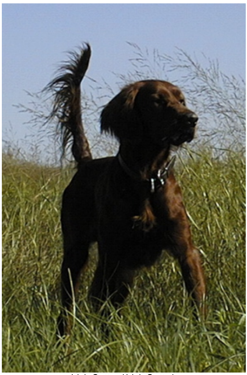
Irish Setter (Irish Setter)