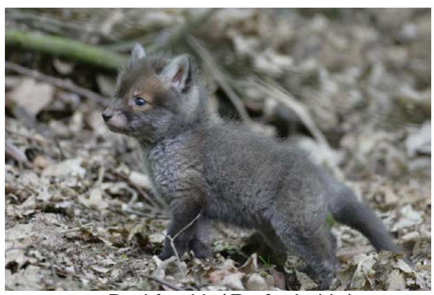
Red fox kit (Rotfuchskitz)