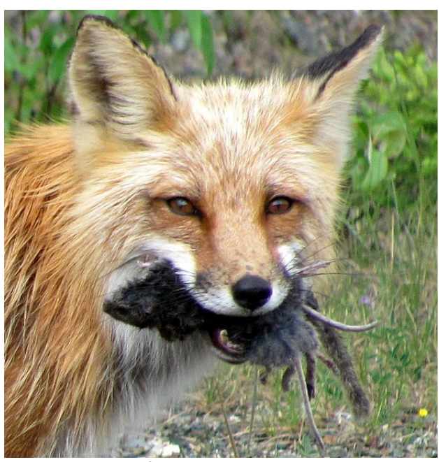
Red fox with rodent prey

As one of the mandatory duties placed by law ( Bundesjagdgesetz ) on hunters for the protection of all game, Fox numbers must be reduced where problems occur.