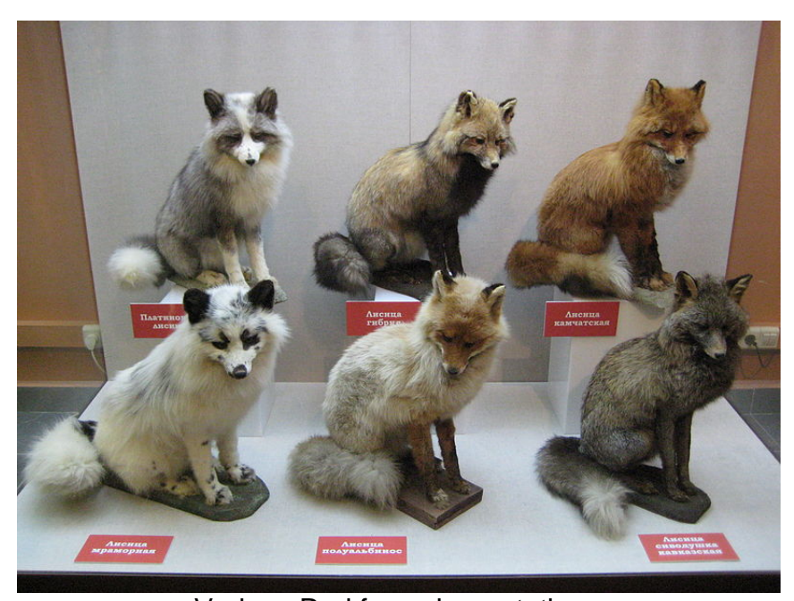
Various Red fox color mutations

Normal Red Fox coloration is not the only pattern found in this animal. The "Birkfuchs" has a yellow-red back, white throat and a very large tail. There is also a "Kreuzfuchs" which carries a dark spine stripe crossed by a shoulder stripe, hence the name.