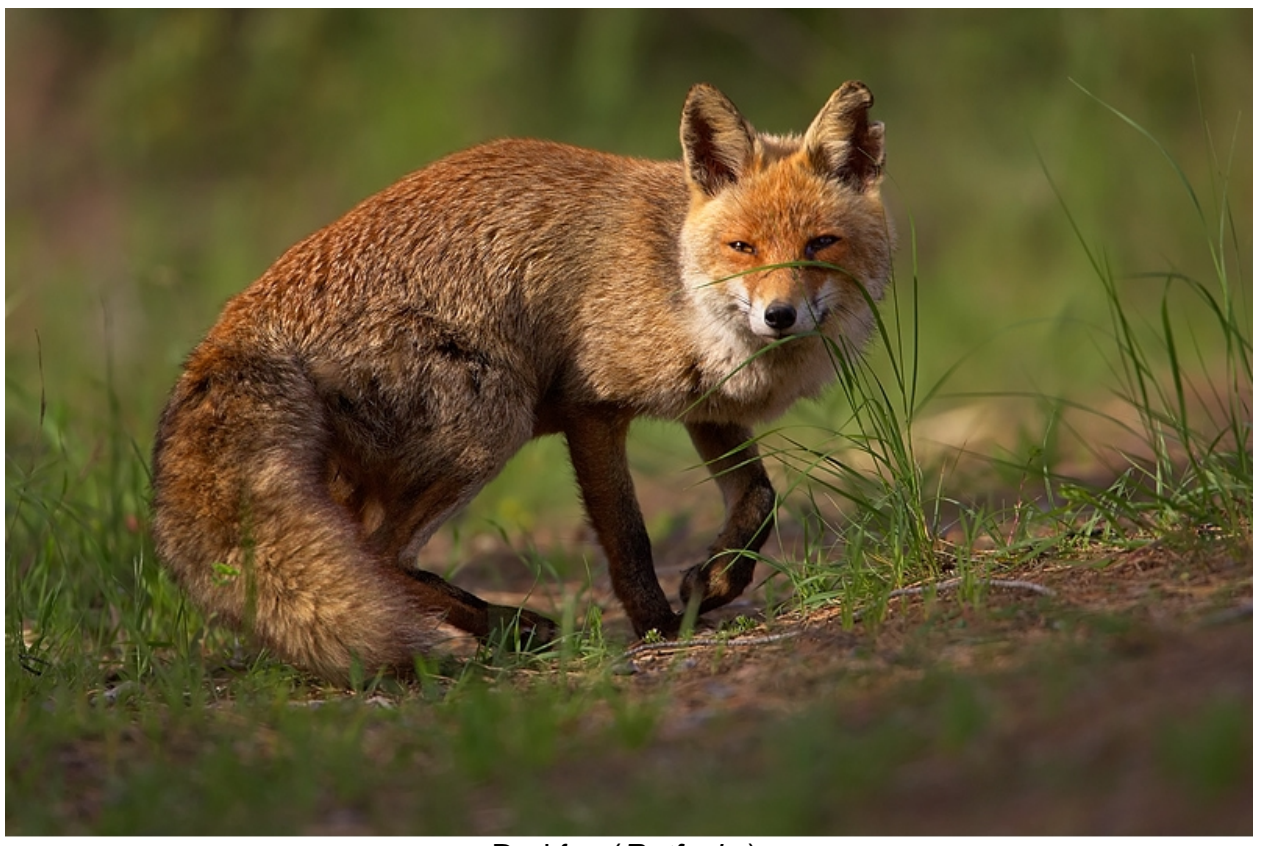
Red fox (Rotfuchs)