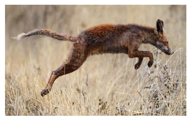
Museum display of Red fox attacking prey