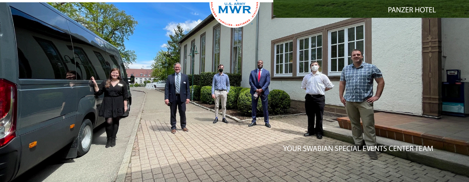
YOUR SWABIAN SPECIAL EVENTS CENTER TEAM